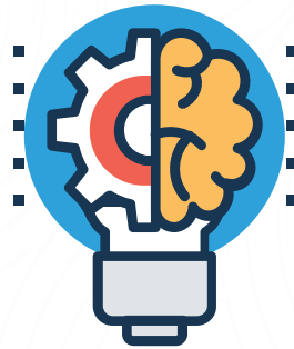
Industry Based Knowledge