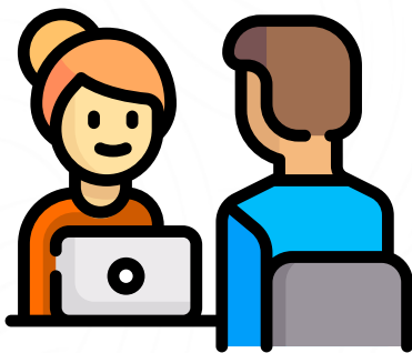
Interview Preparation Sessions